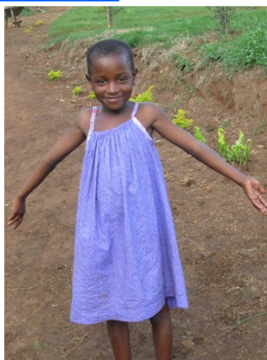
A young girl in Uganda modeling her new dress.

You don't have to know how to sew to help on that day! We will need people who can cut and iron fabrics, and then fold and pack the dresses as they are made. This will be a fun day full of joy and fellowship as we work together to share God's love with children all around the world. We hope you will choose to join us!